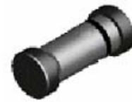
SURFACE MOUNT LL34