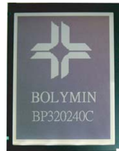
(Options : Frame without ears)