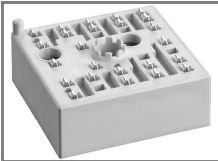
MiniSKiiP ® 1

3-phase bridge rectifier + brake chopper + 3-phase bridge inverter SKiiP 14NAB065V1