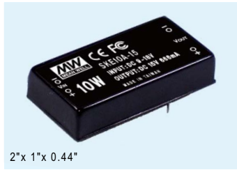
2"x 1"x 0.44"