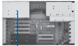
▲ Top view

Equipped with a power supply bracket securing the power supply better when the chassis is positioned in 90° orientation