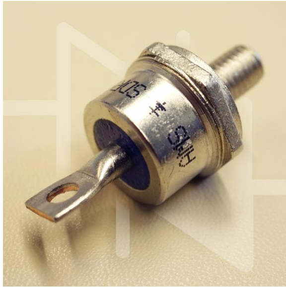
Image shown is a representation only. Please refer to specifications for exact electrical and dimensional measurements.