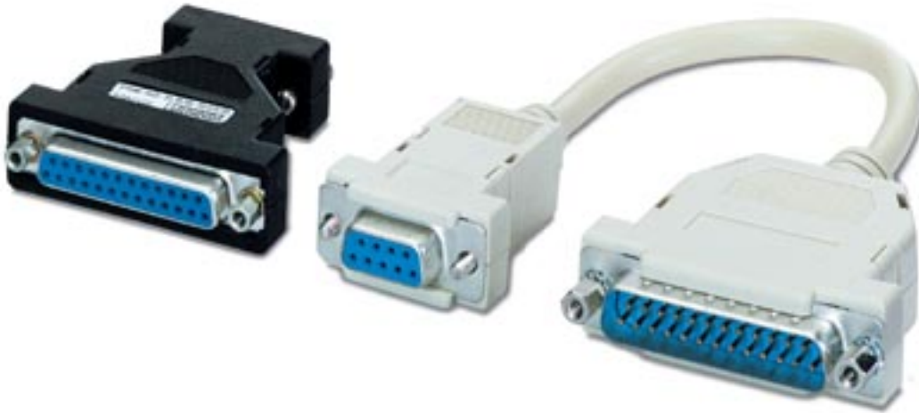
Figure may contain other products.