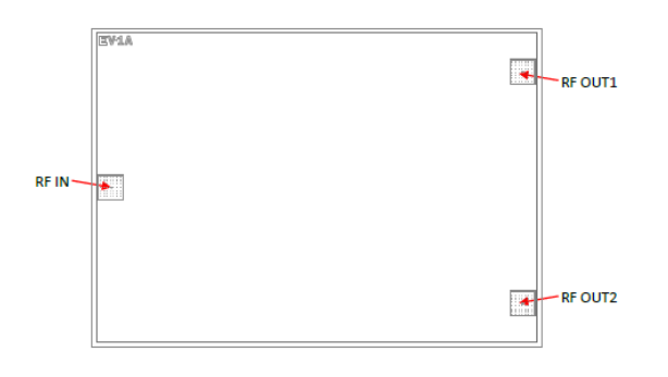
Fig 2. Die Layout