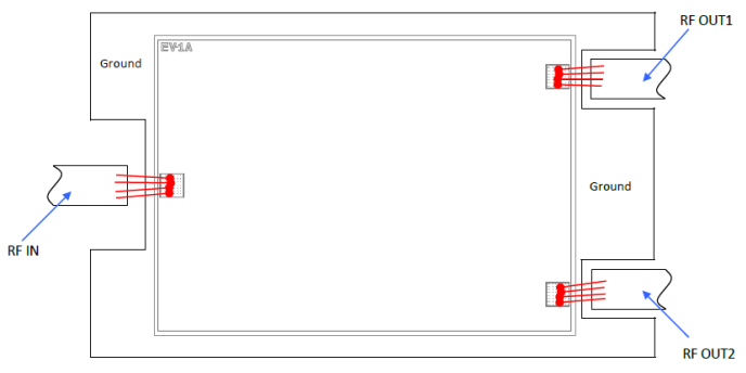
Four 1 mil bond wires should be used for RF input and RF output.