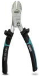
Power diagonal cutter, 200 mm, induction-hardened cutting, VDE 1000 V AC/ 1500 V DC tested

Please be informed that the data shown in this PDF Document is generated from our Online Catalog. Please find the complete data in the user's documentation. Our General Terms of Use for Downloads are valid ( http://phoenixcontact.com/download )